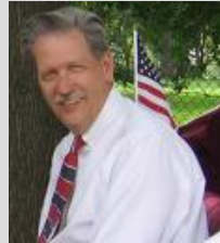
Mayor James Hovland City of Edina