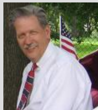
Mayor James Hovland City of Edina