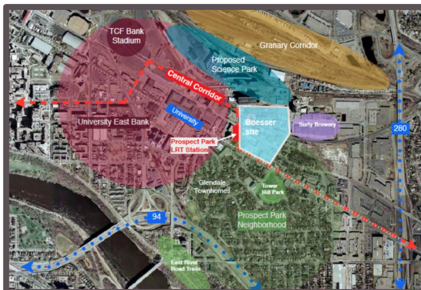
The Prospect North Innovation District